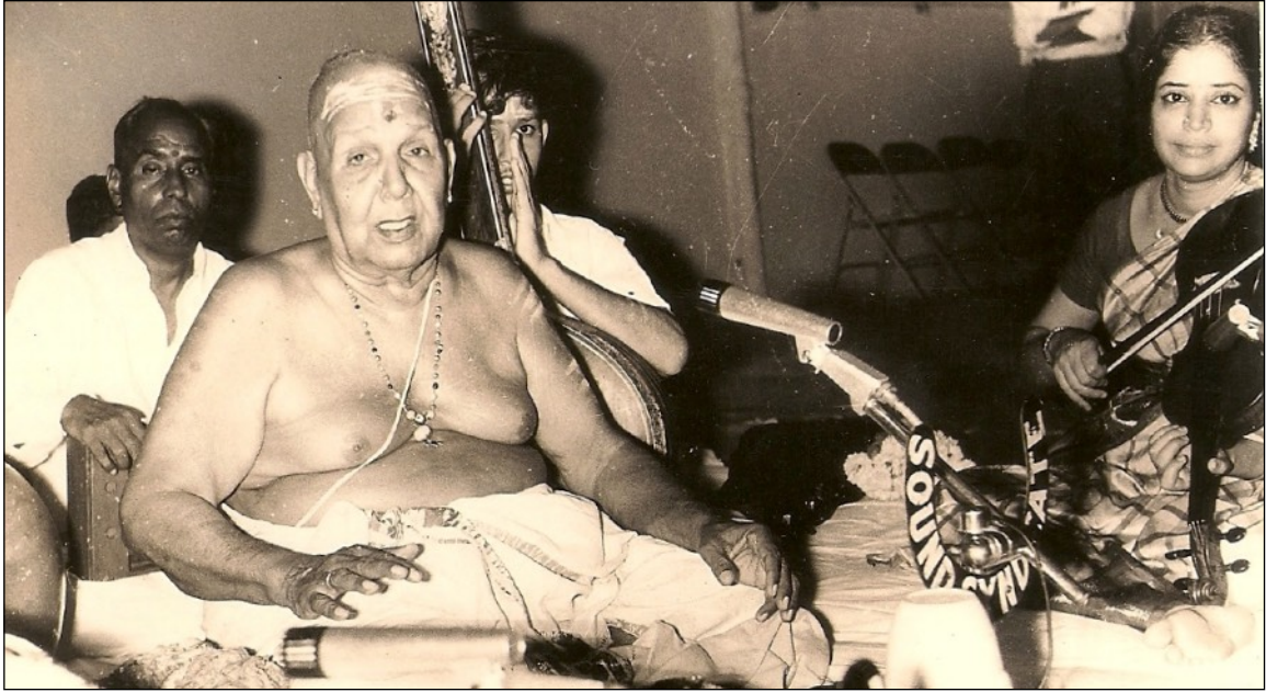
With the doyen Chembai Vaidyanatha Bhagavathar