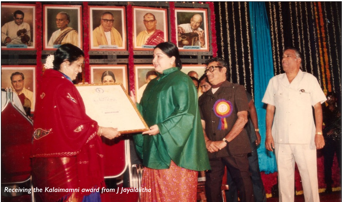
Receiving the Kalaimamni award from J Jayalalitha

Her first major public concert came when she was barely 16 years old. She was asked to ac-