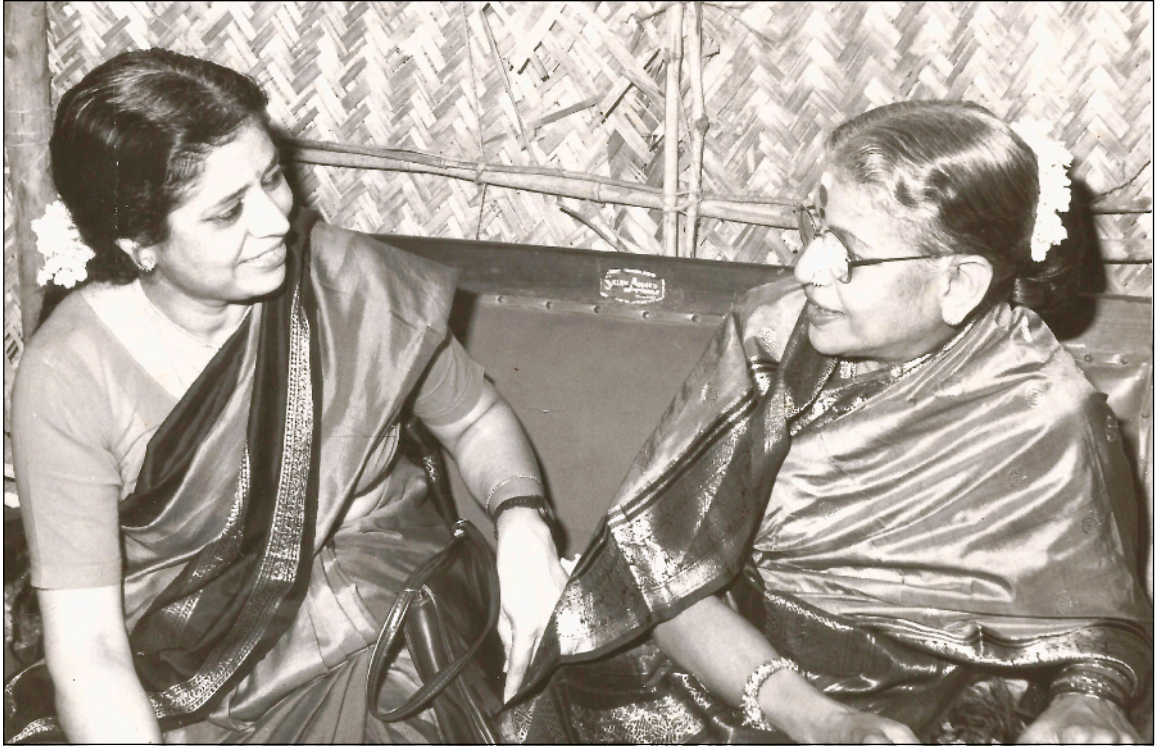
With MS Subbulakshmi