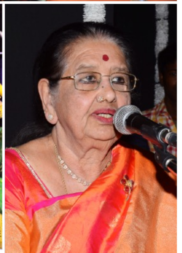
Spring Music Festival - 2017