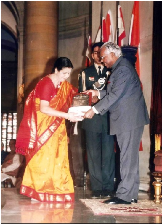
Receiving the 'Sangeet Natak Akademi Award from President KR Narayanan