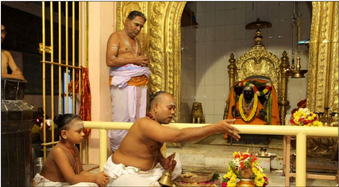
We offer our humble tribute to Saint Thyagarajaswami on the occasion of his 250th Jayanthi