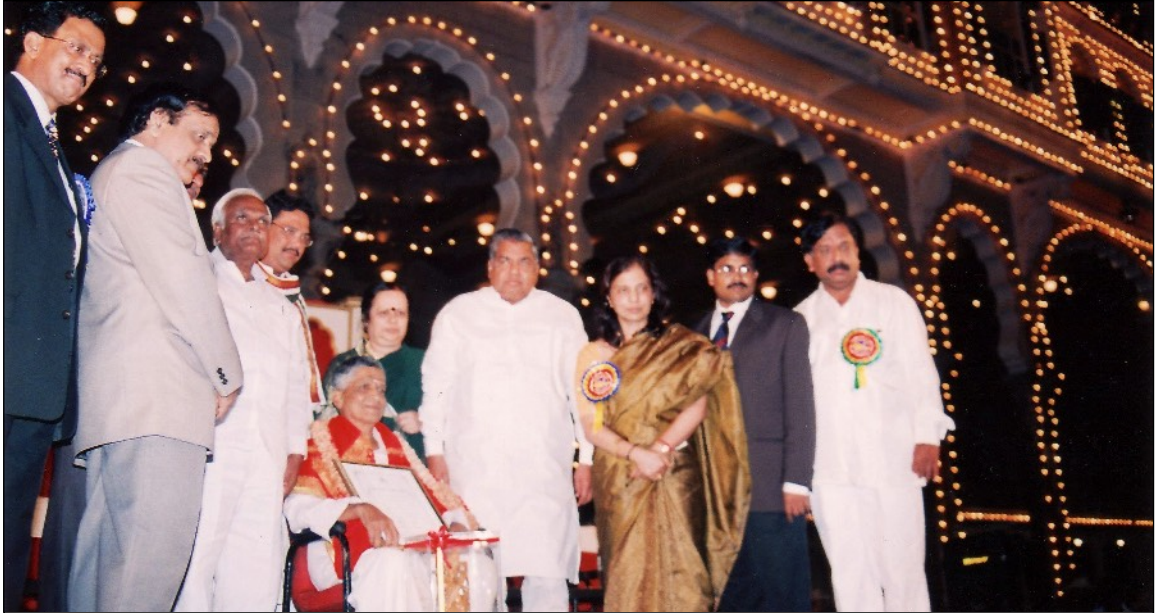
Being honoured with the highest state Music Award "State Sangeetha Vidwan" by then CM N. Dharam Singh