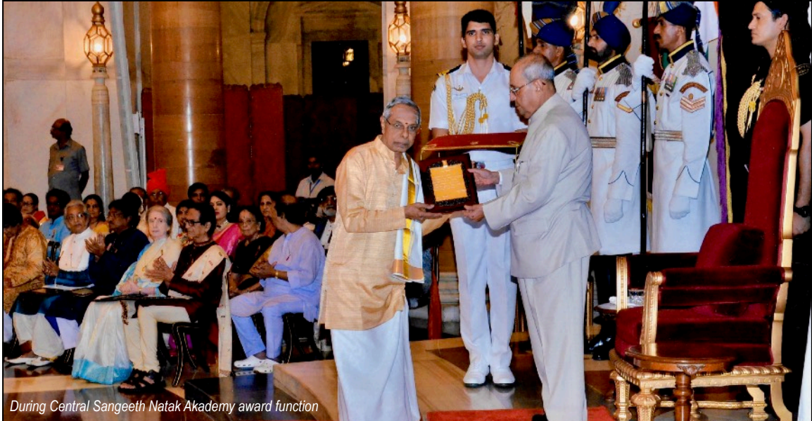
During Central Sangeeth Natak Akademy award function

emics too. Even after they secured jobs, they continued to straddle adeptly both music and non-music worlds with the same level of proficiency and dedication.