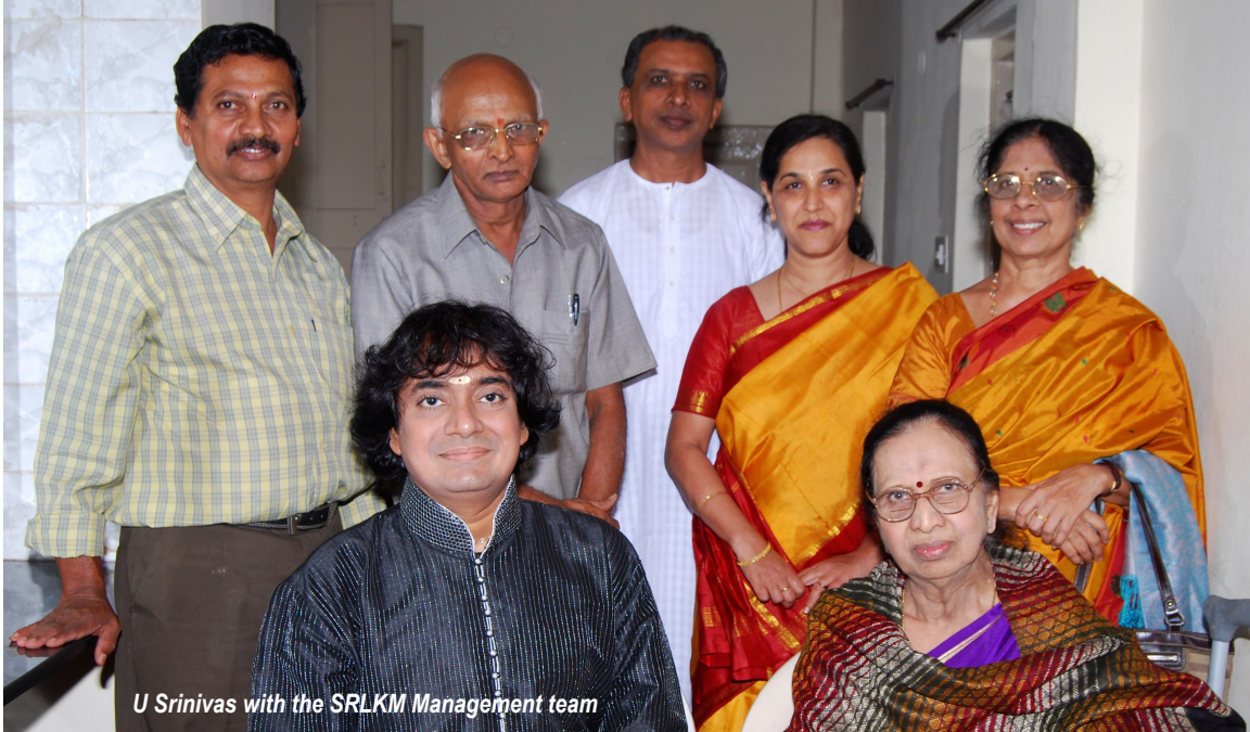
U Srinivas with the SRLKM Management team

started on time. A thunderous applause greeted the lad who ascended the dais with his father and bowed his head to the vast assembly with his customary smile. After paying his respects to the accompaniments, he mesmerised the audience by his artistry. There was pin drop silence and each item he dished out carried the stamp of authenticity, originality and was in regular format.