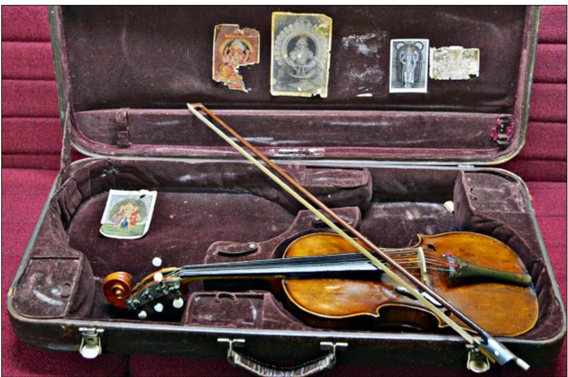
7 string Violin used by Mysore T Chowdiah preserved at the Chowdiah Memorial Hall by Academy of Music, Bangalore.

started, the somewhat unusual increased sound of the violin distracted the concentration of Bidaram Krishnappa. He looked at the instrument and thundered what is it? Chowdiah said he added 3 strings and made a new formation of the violin. Everyone including Veena Sheshanna were expecting a slap from Bidaram Krishnappa to the disciple. That didn't happen. Krishnappa stopped singing and asked Chowdiah to continue playing. He mustered all the courage and played. Bidaram Krishnappa did not speak but started thinking will this new invention be accepted by music world? Will the staunch traditionalist accept this violin? How can I support Chowdiah? Will Chowdiah face the stiff opposition from the traditionalists etc.