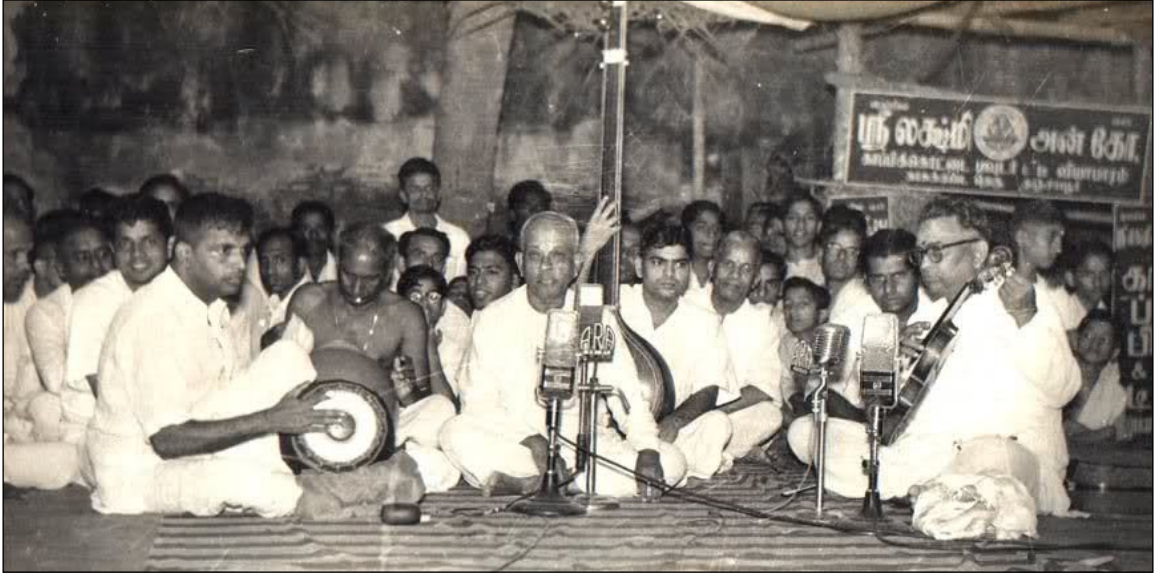
Mysore T Chowdiah accompanying Ariyakudi Ramanuja Iyengar with Palghat Mani Iyer on Mridangam

swaras. This only shows how much Chowdiah was deeply involved in concert and responsible for its overall success.