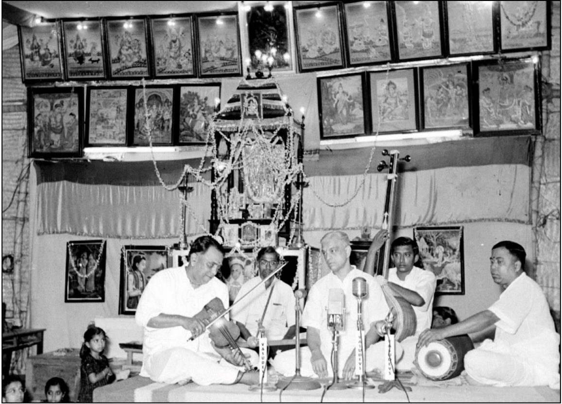
Mysore T Chowdiah's performing with GN Balasubramaniam with Pazhani Subramania Pillai on Mridangam at Sree Ramaseva Mandali, Chamarajpet