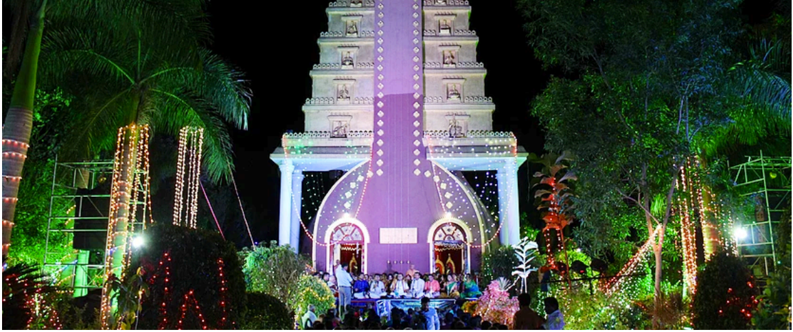
During a music festival at 'Saptaswara Dhyana Mandira', Rudrapatnam