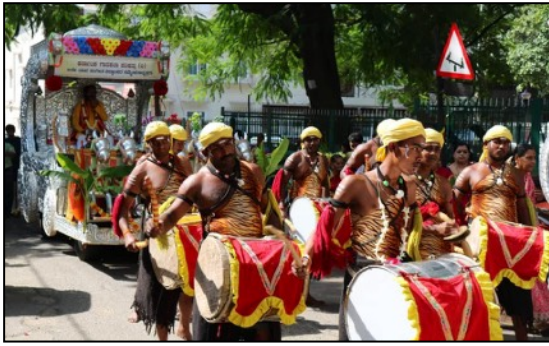
Karnataka Ganakala Parishat president (Ganakala Bhushana) being taken on a procession