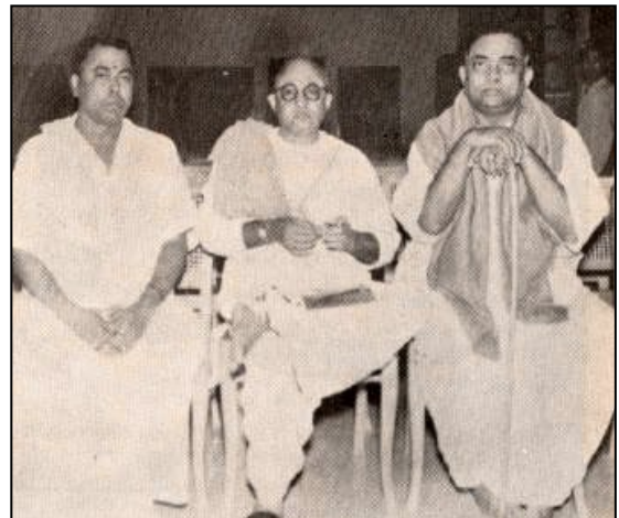
Mysore T Chowdiah along with Semmangudi Srinivasa Iyer and the mridangam legend Pazhani Subramania Pillai