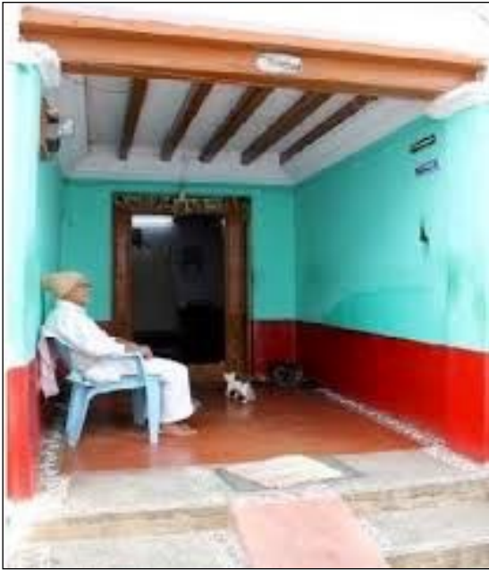
Mysore T Chowdiah's house in Tirumakudalu

(Translation credit Asha Ramesh, Bangalore)