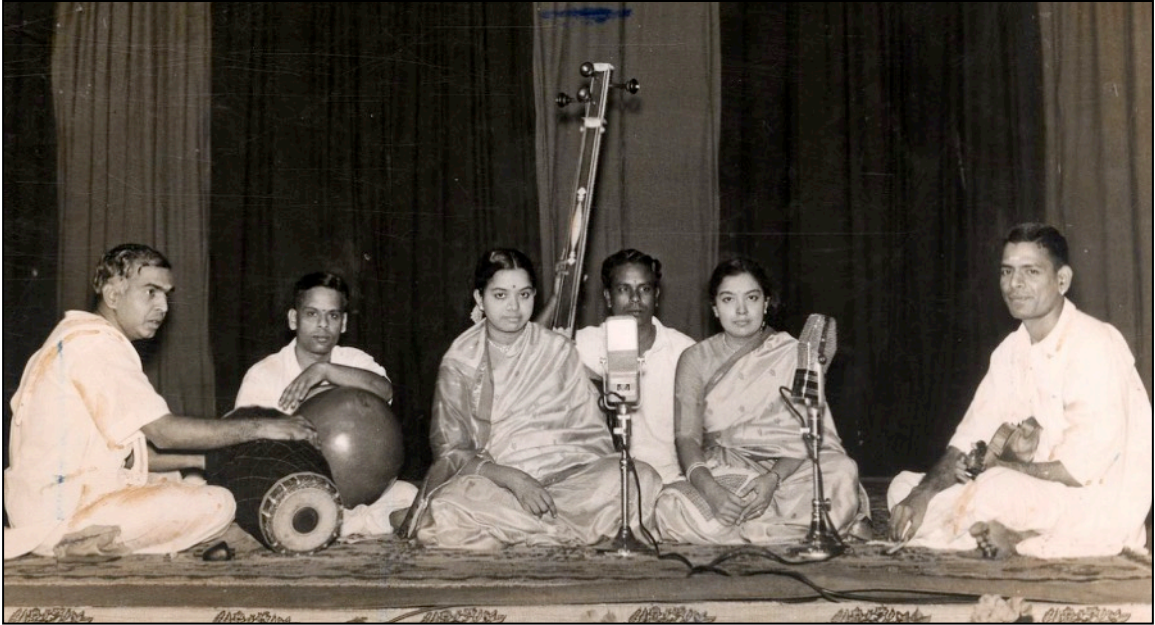
File photo with MS Gopalakrishnan on Violin and Palghat Mani Iyer on Mridangam