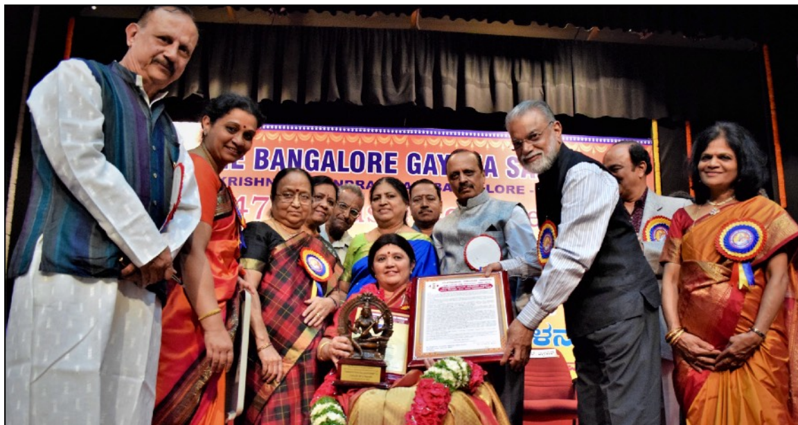
Receiving the Sangeetha Kalan Ratna award at The Bangalore Gayana Samaja