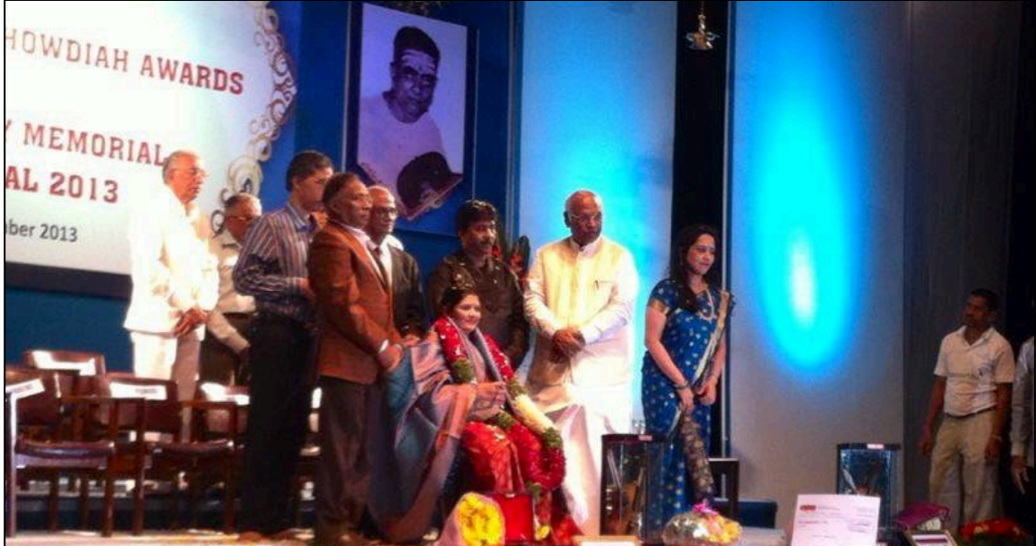
Receiving the Chowdaiah Award instituted by Academy of Music from Mallikharjuna Kharge

ple was carrying on his Parampara the right way.