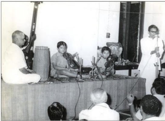
Ganesh and Kumaresh at their first concert in Chennai - 6 Dec 75

While they were practising, they saw an old man selling Elantha Pazham standing near the window of the room and listening to their practice. At once they stopped playing, and sat down with their favourite books, Alistair Maclean novels. After some time there was a knock on the door. That same fruit vendor peeped in, and said, "Thambi, why did you stop playing? That Gaula was going on so well!"