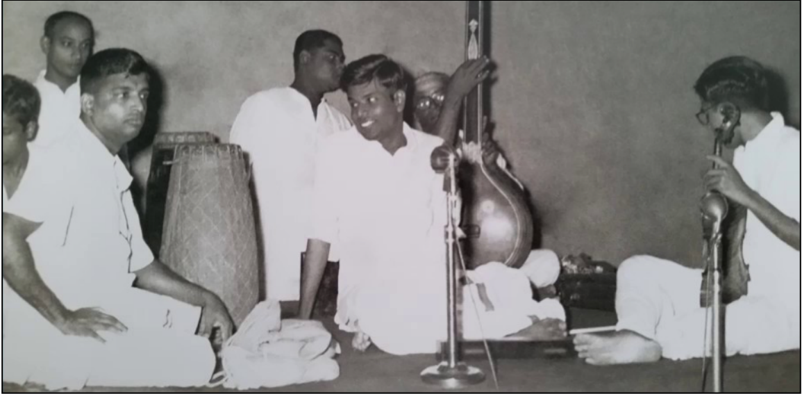
Young TR Mahalingam in a concert with TN Krishnan and Palghat Mani Iyer

he would forego very lucrative concert offers and accept the non-remunerative ones for the sheer joy of playing with people like Palakkad Mani Iyer.