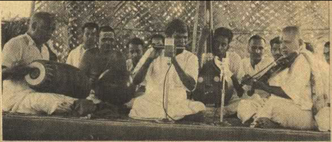
This rare photograph, taken at the Tyagaraja Sangita Vidwat Samajam in Mylapore, Madras, shows Chembai Vaidyanatha Bhagavatar and Maharajapuram Viswanatha Iyer accompanying Flute Mali on the violin and mridangam respectively.