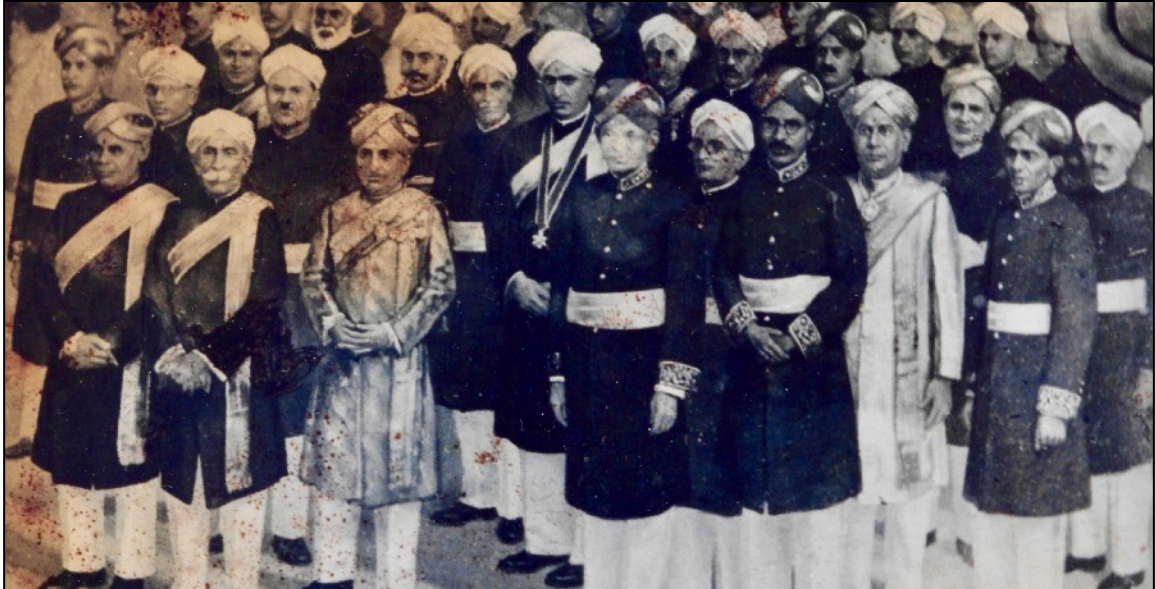
During Dasara festival: Standing front row - from left Mysore Vasudevachar, Veena Subbanna, Veena Venkatagiriappa